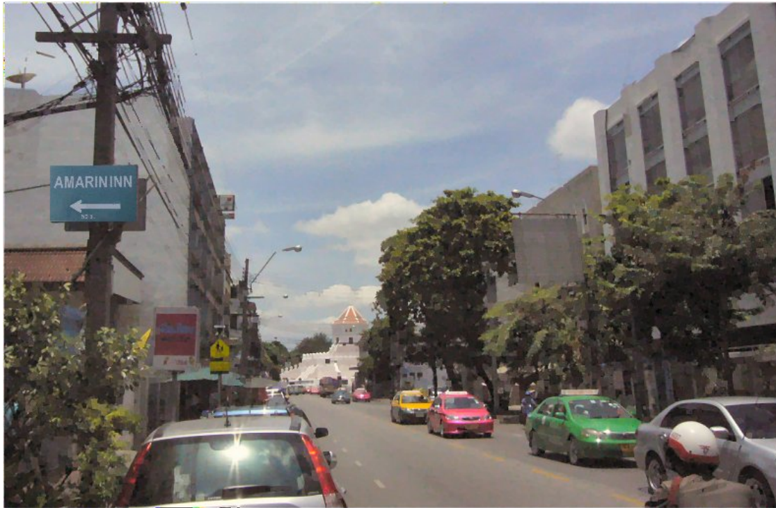
Phrasumen Road –